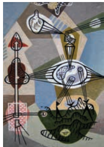
3.15 Claes Oldenburg, The Way , 1965. Oil on canvas, 100 x 100 cm.

This painting is a mix of abstract forms and recognizable shapes, creating a sense of movement and depth. It features a central figure that looks like a stylized, elongated form with various colors and patterns. The background is a mix of blue, green, and yellow, with some geometric shapes and lines.