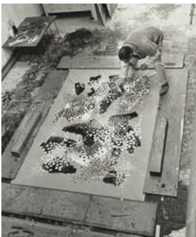
3.18 Claes Oldenburg, The Way , 1965. Oil on canvas, 100 x 100 cm.